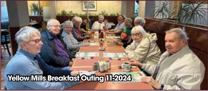
Yellow Mills Breakfast Outing 11-2024