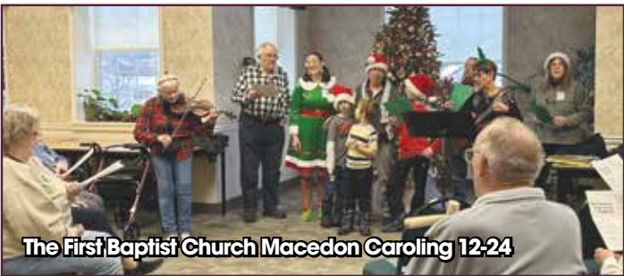
The First Baptist Church Macedon Caroling 12-24