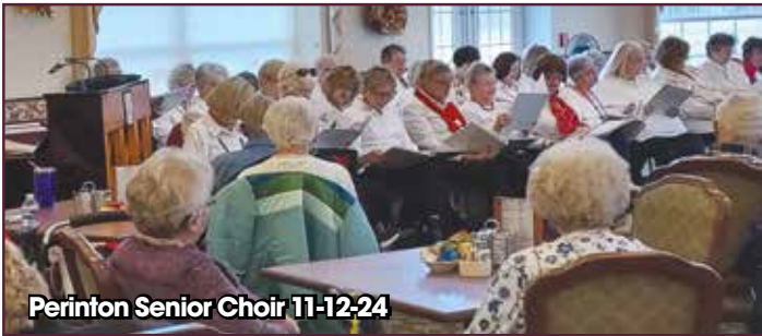
Perinton Senior Choir 11-12-24