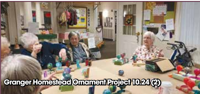
Granger Homestead Ornament Project 10.24 (2)