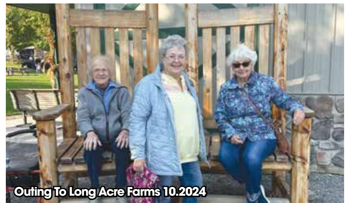
Outing To Long Acre Farms 10.2024