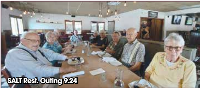
SALT Rest. Outing 9.24