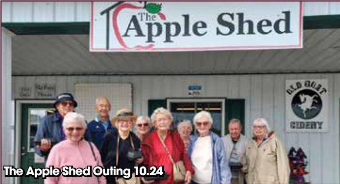
The Apple Shed Outing 10.24