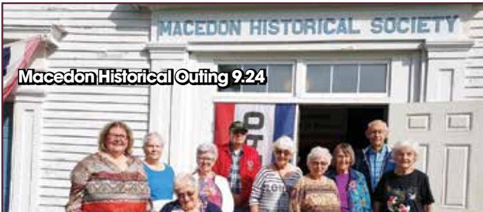
Macedon Historical Outing 9.24