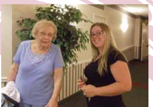
Receptionists are always pleasant and helpful. They always go out of their way to make things nice. - Grace S.