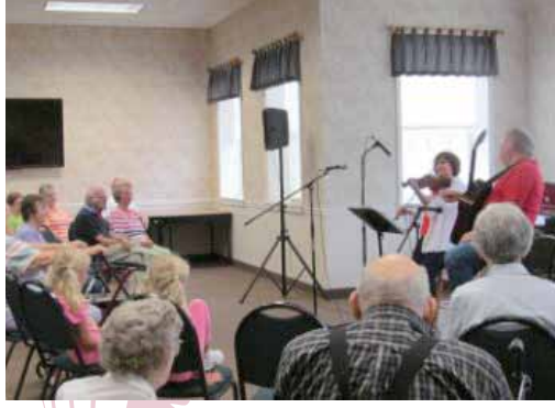
There is a great variety of activities and the staff are willing to do anything! - Jeannette M.