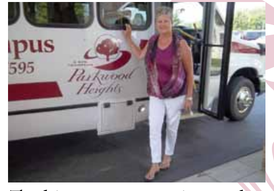
The drivers are super caring people who always do a good job. - J. B.