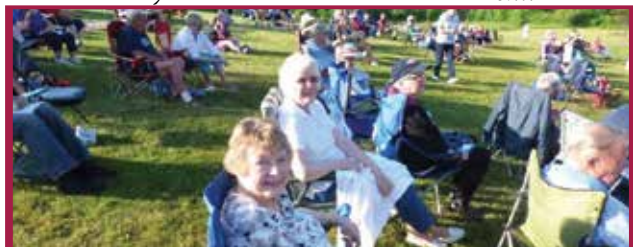
Evening Concert Sid Memorial Park