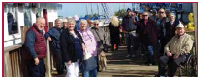
Fall Foliage Boat Cruise