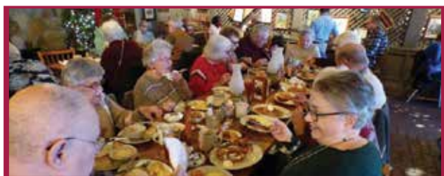
CrackerBarrell Lunch Outing