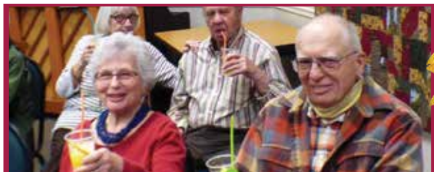
Caribbean Day with Steele Drums Entertainment.