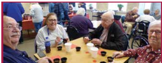
PWH Chili Cook-Off