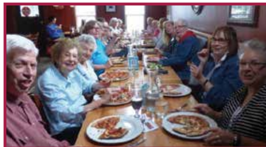
China Buffet Lunch Outing